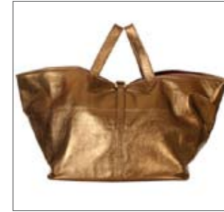
Bronze Leather, big Size