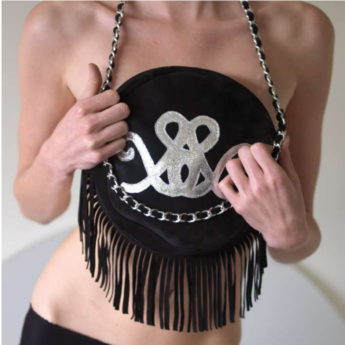
'Bon Bon' bag