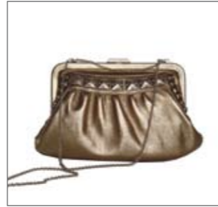
Bronze clutch, small size