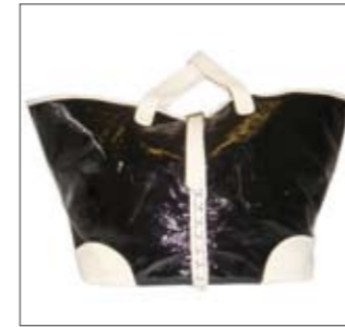
Black patent and cream leather, big size