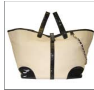
Cream leather and black patent, big size