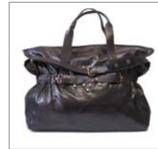
Navy blue leather