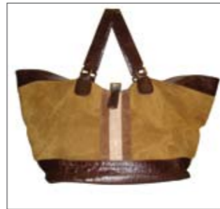
Brown suede and croc, big size