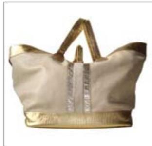
Cream leather and gold croc, big size