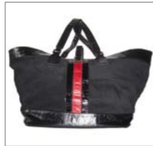
Black suede and croc, big size