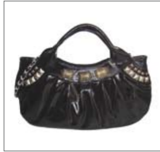
Black patent leather, large size