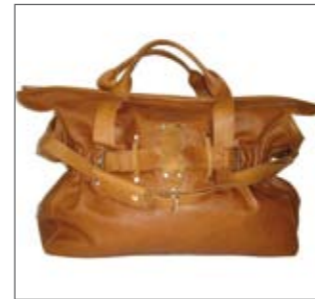
Rust distressed leather