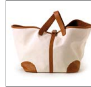
Cream canvas and tan leather