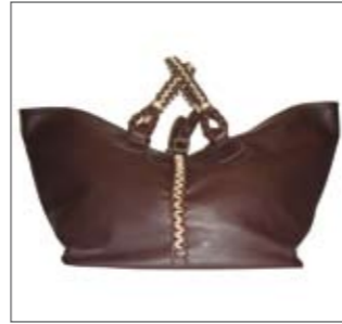
Chocolate leather, big size