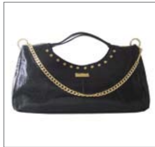
Black patent snake skin