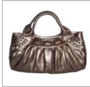
Gunshot leather, medium size