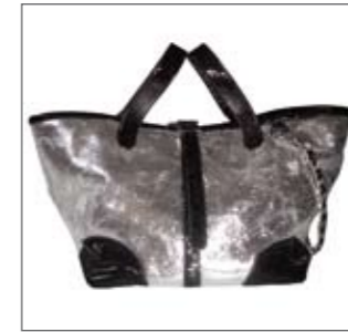
Silver cracked and black patent, medium size