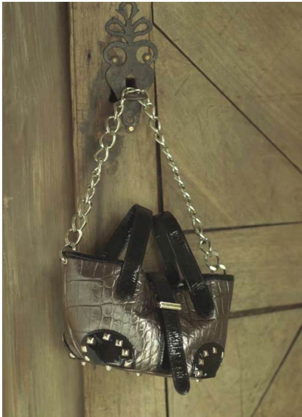
'Rock n Roll' bag