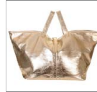
Gold Leather, big Size