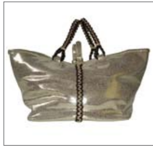
Gold cracked leather, big size