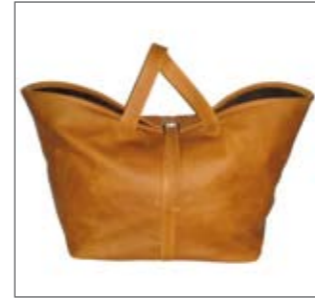
Rust Leather, big size