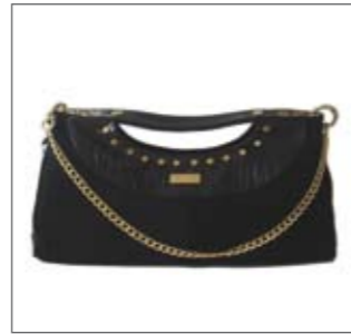
Black suede and croc