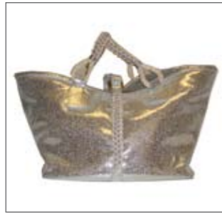
Silver cracked leather, medium size